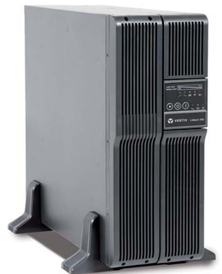
Liebert PSI XR 2U Tower version