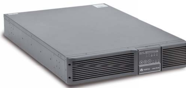
Liebert PSI XR 2U Rack version