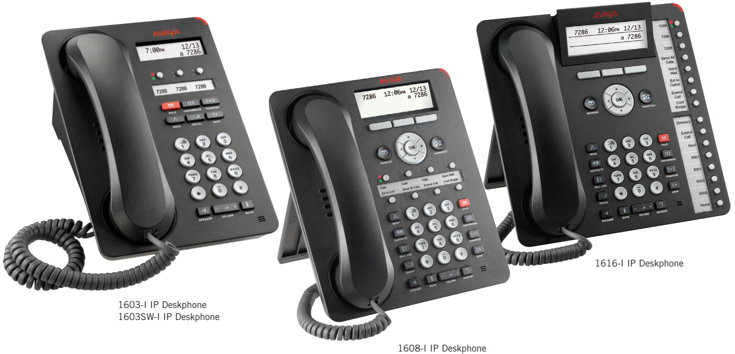
1603-I IP Deskphone 1603SW-I IP Deskphone